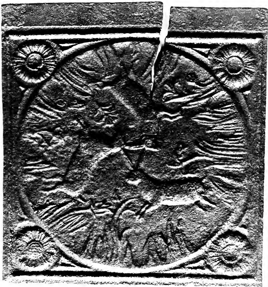
Stove plate by the Redwell Furnace; cast iron; Shenandoah Co., Va.; 1790-1800. HOA 21"; WOA 23". MESDA acc. 3290.2.